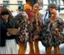
Krapina's špelancije (February/March)

Gajeva 14 Tel (information) 00385 (0)49 370 561, 00385 (0)49 370 810 Fax 00385 (0)49 370 810 E-mail: pou-krapina@kr.t-com.hr, galerija@krapina.net www.krapina.net Group visits by appointment on tel 00385 (0)49/370 810, 00385 (0)49 370 561 Closed on Monday