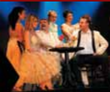
Actors Festival in Krapina (after Easter)