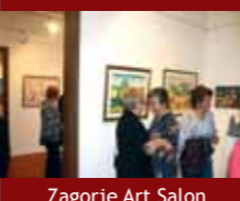
Zagorje Art Salon (triennial event)