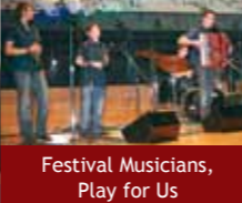
Festival Musicians, Play for Us (June)

TOURIST BOARD OF KRAPINA Magistratska 11 49000 Krapina