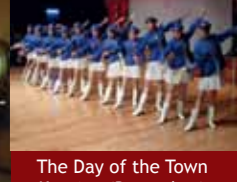
The Day of the Town Krapina (December)

Tel 00385 (0)49 371 330 Fax 00385 (0)49 371 330 E-mail: tzg-krapina@kr.htnet.hr www.tzg-krapina.hr