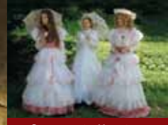
Summer in Krapina (August)

Štetaliste Vilibalda Sluge bb Tel (reservation) 00385 (0)49 371 491 Tel (information) 00385 (0)49 374 951, 00385 (0)49 374 952, 00385 (0)49 374 954 Fax 00385 (0)49 374 968, 00385 (0)49 374 969 (reservation) E-mail: mkn@mhz.hr www.mhz.hr