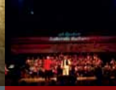
Kajkavian Song Festival (September)